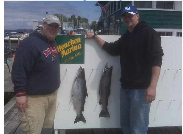
Spring Atlantic and Steelhead