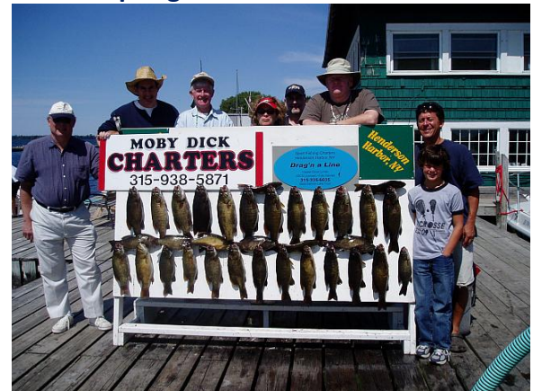
Multiple boat charters available